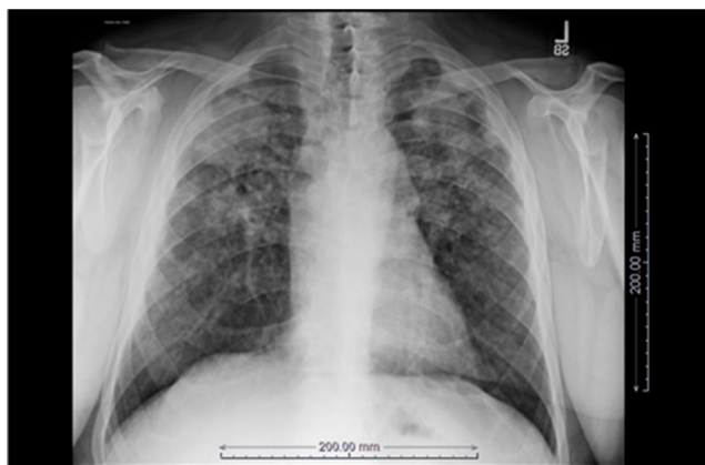
Fig. 5 Chest radiograph image taken in 2016 of a 56-year-old male eastern Kentucky resident with 29 years of total mining tenure (including 11 years as a roof bolter). Image classified as category C large opacity, with 3/2 small opacity profusion, and primarily rounded opacities (q-type)

In order to systematically identify and assess the presence and severity of abnormalities of pneumoconiosis associated with respirable dust exposure using chest radiography, physicians need to use a standardized scoring procedure including reference standards (standard radiographs) (Fig. 5) [63]. The ILO International Classification of Radiographs of Pneumoconioses has met this need since 1950 [10]. The ILO Classification System includes standard comparison films and detailed descriptions of abnormalities and other radiographic