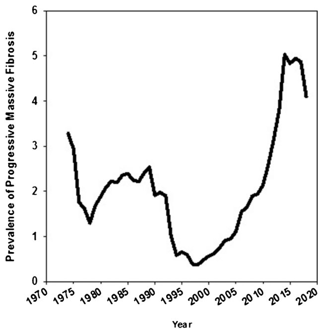
Fig. 2 Prevalence of progressive massive fibrosis among working underground coal miners with 25 or more years of underground mining tenure participating in the Coal Workers' Health Surveillance Program in Kentucky, Virginia, and West Virginia, 1974–2018. Note: Data are presented as the 5-year moving average percentage; surveillance is conducted on a 5-year national cycle

Data collected through the CWHSP have made it possible to study potential determinants of pneumoconiosis in US coal miners [19]. In reviewing these studies, it is important to remember that exposure to coal mine dust is the sole cause of pneumoconiosis in coal miners. Thus, epidemiological studies which assess correlates of exposure with pneumoconiosis must be viewed with the understanding that these correlates serve as surrogates for the respirable dust generated through the process of mining coal. Presence of pneumoconiosis and abnormal lung function assessed by spirometry have been found to be associated with working in a small mine (defined as 50 or fewer employees) [14, 20], low seam height (defined as less than 43 in. [21]) [16], miner age, mining tenure (Fig. 1), coal rank, and region (a surrogate for coal rank, mine size, and seam height) [22]. Identification of these factors has allowed for more directed surveillance outreach efforts to at-risk groups and additional studies using data sources other than the CWHSP. [18, 23, 24].