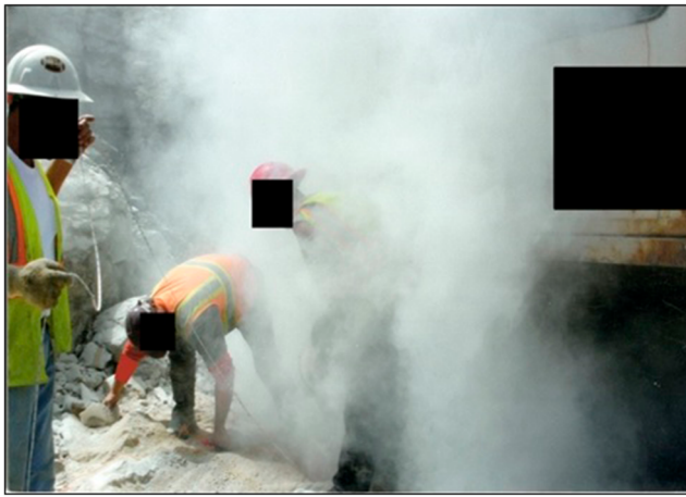
Fig. 3 Photograph taken by a miner in 2012 at a surface coal mine; it shows three miners enveloped in a dust cloud loading drill holes to blast overburden. Reprinted with permission from “Debilitating Lung Disease Among Surface Coal Miners With No Underground Mining Tenure,” by C.N. Halldin, W.R. Reed, et al., 2015, J Occup Environ Med , 57 [1]:62–67

of respirable silica and silicate particles. The severe pneumoconiosis identified in these miners was likely primarily silicotic resulting from exposures to respirable crystalline silica generated by drilling blast holes during surface mining activities.